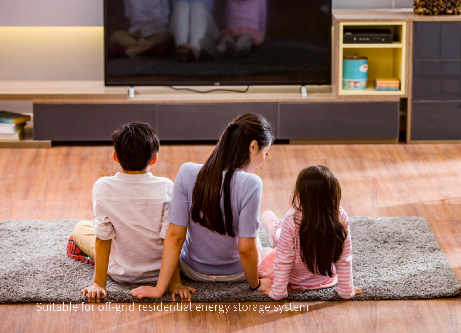
Suitable for off-grid residential energy storage system